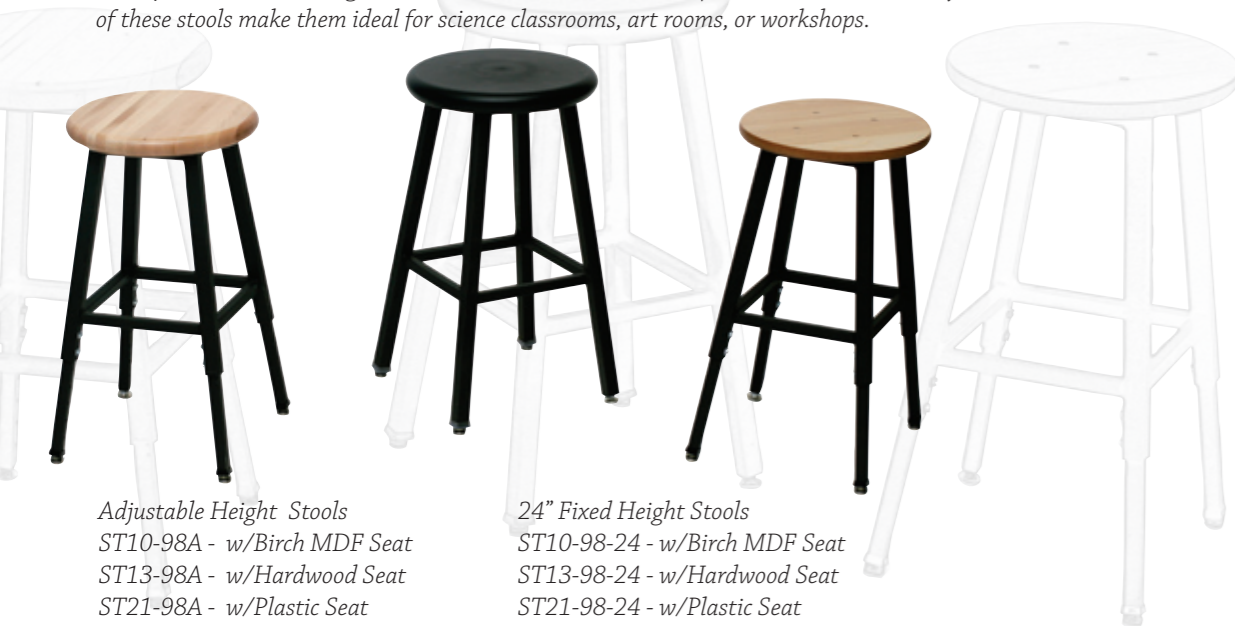
Adjustable Height Stools ST10-98A - w/Birch MDF Seat ST13-98A - w/Hardwood Seat ST21-98A - w/Plastic Seat

ESF stools have a heavy-duty, square tubular steel base with a powdercoat finish. Stools are adjustable or fixed height with a hardwood, MDF or black plastic seat. The durability of these stools make them ideal for science classrooms, art rooms, or workshops.